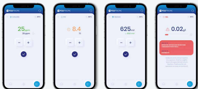
Remote monitoring of the water treatment system: values, settings, and alarms