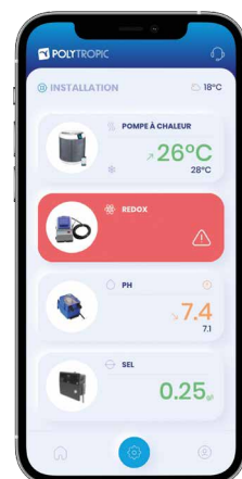
List of connected equipment