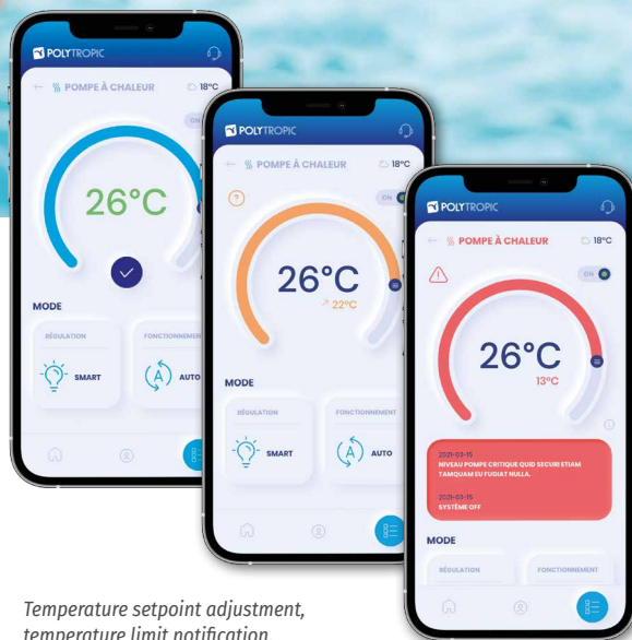
Temperature setpoint adjustment, temperature limit notification, warning message

The application can be downloaded from the Apple Store or Google Play,