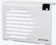
OPTIONAL : CRISTAL High-gloss white metal en option