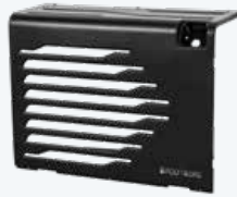
AS STANDARD : DARK ABS 70% recycled matt black

The DARK ABS front panel is fitted as standard, but the optional front panel is supplied assembled: