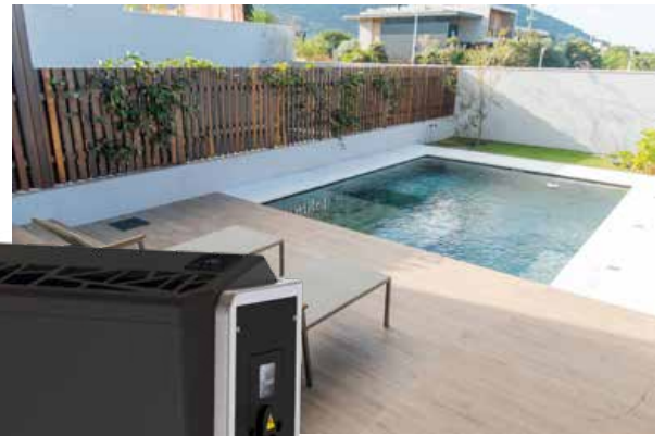
In matt black ABS 70% recycled