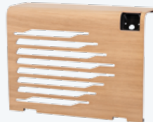
OPTIONAL : WOOD FSC wood from sustainably managed forests Untreated - to be stained.