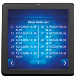
History of the last 50 events