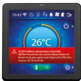
Alarm display, diagnosis and solution