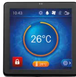
NEW! Lockable TFT screen to prevent mishandling